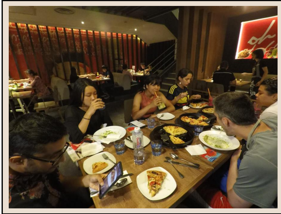
Students enjoying Pizza Hut on their free day

On Sunday students were given a free day to rest and find other activities to do. Students went to check out the shops at Optic Valley Square, a shopping mall a short walk from campus. Hungry for some familiar food students ate at a Pizza Hut near the mall. Feeling adventurous, some students also ordered Chinese style pizzas including durian pizza and eel pizza.