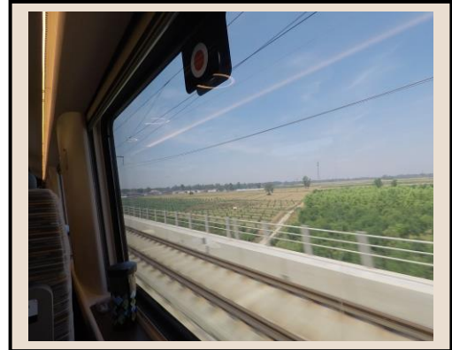
Scenery from high speed train on route to Wuhan

weeks to take Chinese language and culture classes. After a short ride the bus arrived at the Silk Road Institute, the international student dorm that would be the living quarters for the student's stay in Wuhan. The students were met by Rainbow, the organizer of the program in Wuhan. She helped the students get checked in and receive their student cards and keys that are required for entry into dorm as well as hot water and money for the canteen. That night students unpacked and adjusted to their new living quarters.