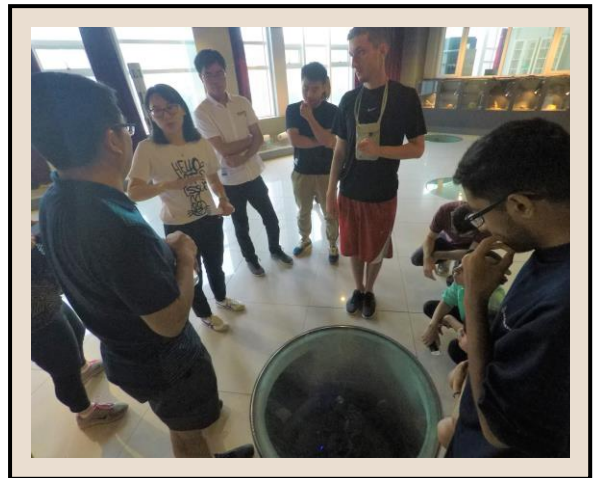
Students learning about extensometers that are housed within the subsidence exhibit.