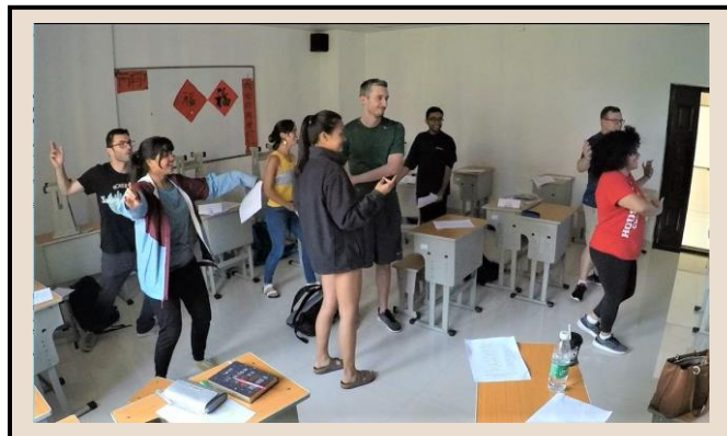
Students learning the Chinese opera choreography