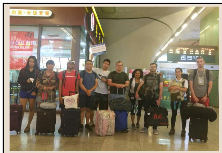
Students arrive at Wuhan railway station.