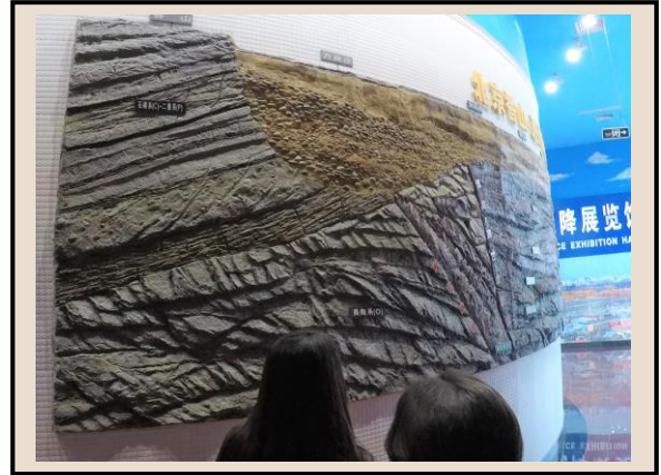
Students observing cross section of Beijing Subsurface. Cross section line runs from west to east Beijing.

Today was the students last full day in Beijing before traveling to Wuhan. In the morning the group met Dr. Wang and local experts with the Beijing Institute of Hydrogeology and Engineering Geology, and traveled by private bus to the Beijing Subsidence Exhibition where they learned about the geology of the Beijing subsurface. Especially interesting was the cross section display that depicted the underlying strata of the region. The section displayed the different sequences of soft sediments and depths to the underlying bedrock by using realistic sediments and rock-like surfaces to create a life-like depiction of the geology. Within the Exhibit are several extensometers and water level monitoring wells up to 1700 m down to the bedrock. Also on display is information about hazards of subsidence to educate the visitors about the importance of studying and monitoring subsidence and why it is necessary to invest in subsidence research. After the conclusion of the tour the group then returned to the dorm to prepare for travel the next day.