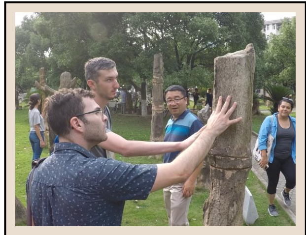
Admiring the fossil wood specimens