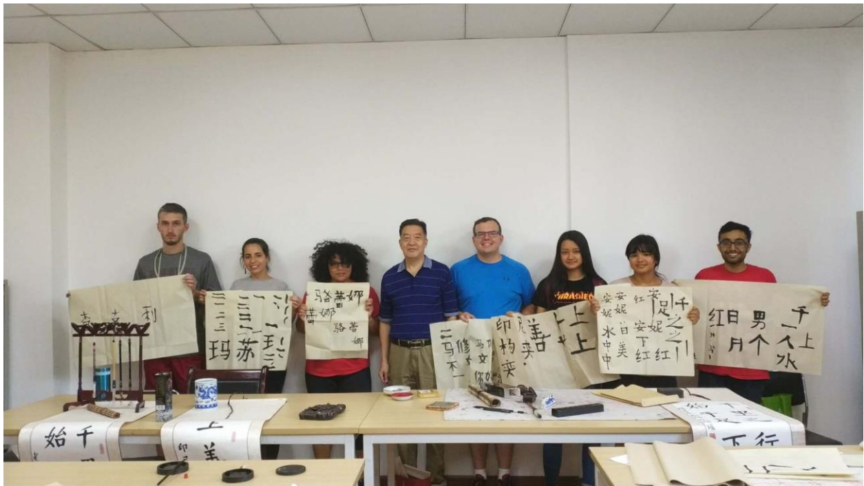
Chinese Calligraphy Class