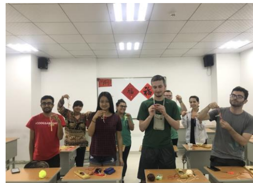
Chinese Knot Tying