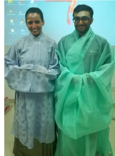
Tai Chi Class