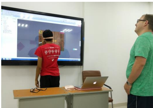
Collaborative Fruit Ninja

Today's morning class was on asking for directions. The instructor made the class very interactive by having us play several games. For the first game, the students broke up into groups to play Fruit Ninja; one student was blindfolded while the other student had to yell out where the fruits were flying: left, right, top, bottom, middle (in Mandarin). The first game was challenging, but it really helped everybody think on their feet. Next, one team member had to help the blindfolded student locate hidden students throughout the room by yelling out the commands and by the end, everybody had a good grasp on the basic directions. In the afternoon, the students attended a Chinese knot tying class. They produced several knots including a Chinese luck symbol and cute little dragonfly. After that, it was off to the Tai Chi class once more!