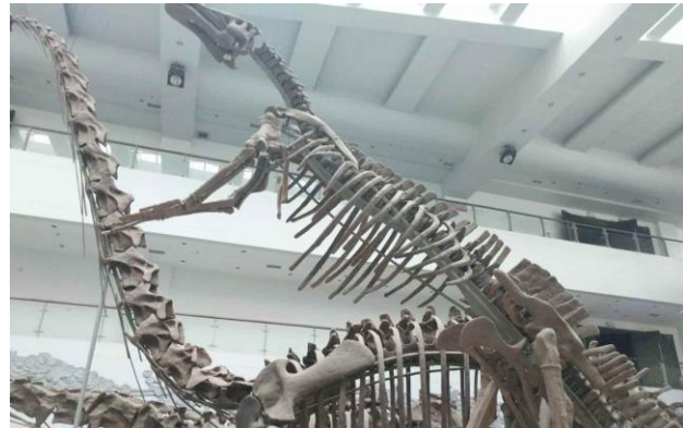
Dinosaur Fossils at the CUG Museum