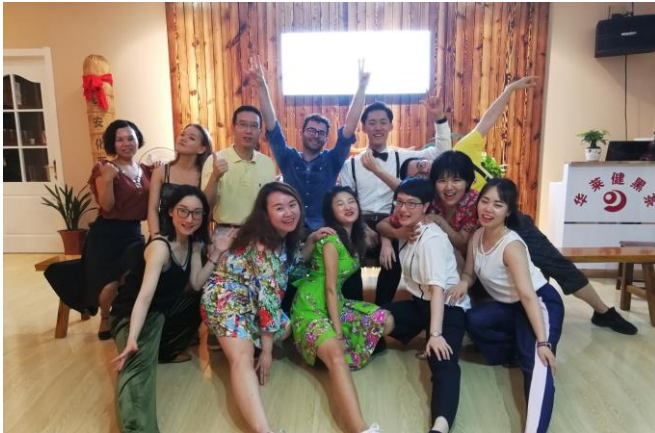
Dancing with Swing Wuhan

Saturday was a break day. One student taught a dance workshop with the local Swing Dance organization and others attended another Tai Chi class and even got to dress in traditional Chinese martial arts clothes. They then went to a local Indian restaurant located in the center of a lake! That night, there was a going away dance party at Swing Wuhan and then the group watched the World Cup soccer game together and prepared for the next day.