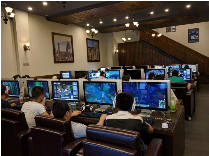
An internet café exists in the private theatre where students watched a movie.