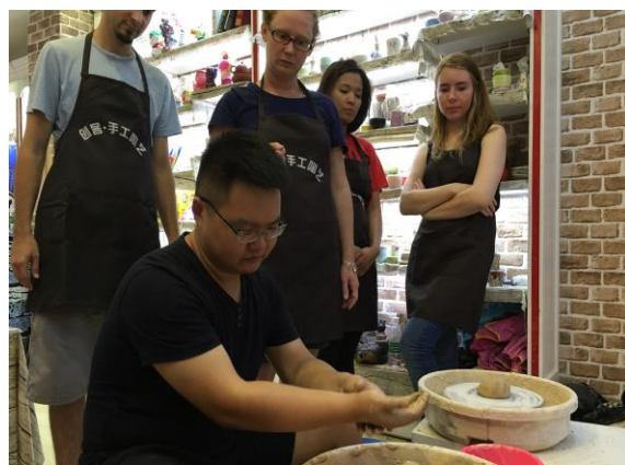
Left: World City Plaza Mall Right: Students learn how to make pottery.