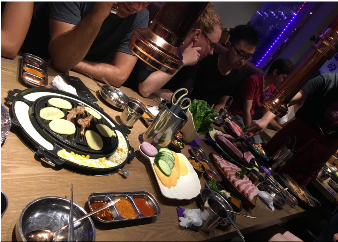
Students enjoy a Korean BBQ meal for dinner.

movie theatre. The students decided on the private movie theatre located in the Roman Cafe just on the outside of the Wanda Plaza. The rooms contained comfy, adjustable lounge chairs, a large projector screen, and dim lights. The students rented out two rooms where they were given a variety of movie choices to choose from in which one room chose a scary movie and the other, a biographical drama. The students were able to relax as they enjoyed the theatre setting and movie choice for the late afternoon. After their movies, the group ventured their way to a tradition Korean barbeque restaurant highly recommended by Suki and her friend. Throughout their period of waiting for their table, the owner of the restaurant greeted the students and asked for pictures with them. The students enjoyed their Korean barbeque meal, where the owner and the other wait staff cooked vegetables and several pieces of various marinated meats right at their tables. The night ended with walking back to the subway station where the students caught the last subway back to their destination, leading them to a taxi to take them back to the dormitory.